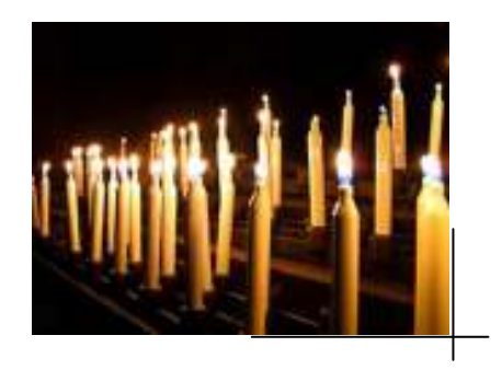
One who follows the path by using compassion as the compass, one day he/she will pass